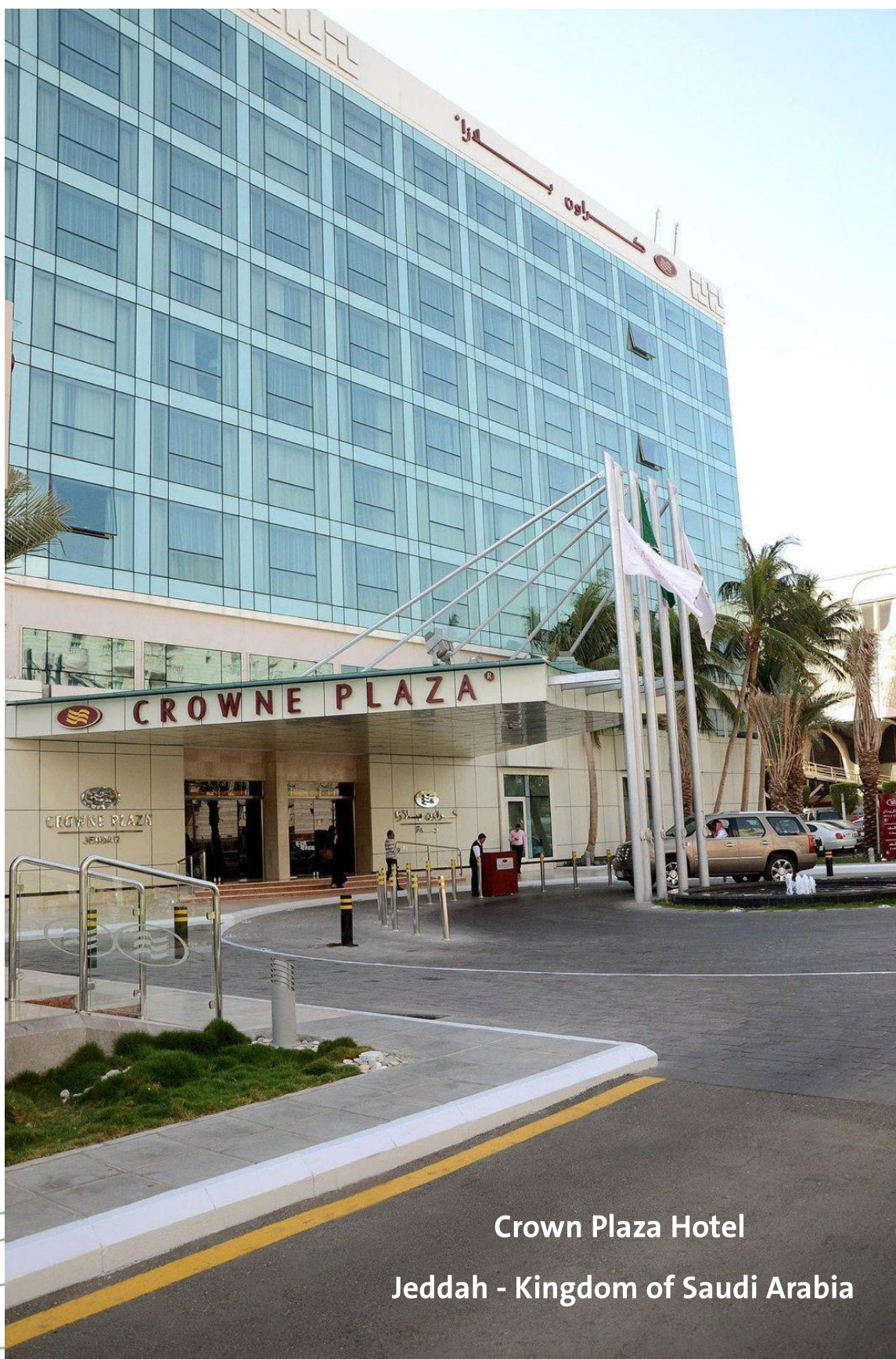
Crown Plaza Hotel